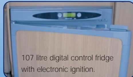
107 litre digital control fridge with electronic ignition.